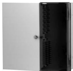
AX100541 Medium Wall Mount