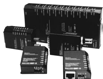
AX050, 70 and 80 Transceivers and AX-509 Ethernet Hub

The AX-50, 70 and 80 transceivers enable the connection of a legacy AUI port to 10Base-T, Thinnet, or Fiber Optic media. The transceiver is powered from the host and requires no external power supply. The AX-509 Ethernet Hub has an AUI port which accepts UTP, Fiber Optic or BNC transceivers. Specified for use by many U.S. Government Agencies. Includes a 110v/12v power supply.