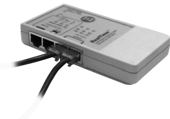
AX-110BT Realtime 10/100 Base-TX Ethernet Network Test Unit

The AX-110BT realtime 10/100 Base-TX ethernet network test unit is a cost effective way to quickly determine a network's operating condition. Plug the unit's patch cord into the tester, then into any open RJ-45 jack in an office, cubicle or conference room. Immediately see if the jack is a live network node capable of either 100 Mb/s or 10 Mb/s. Next check patch cord continuity and polarity. Connect the downlink to a PC to check NIC card link, speed and full or half duplex capabilities. Connect the uplink to a hub or switch port to verify link and speed.