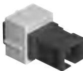
A0649254 SC Duplex Adapter